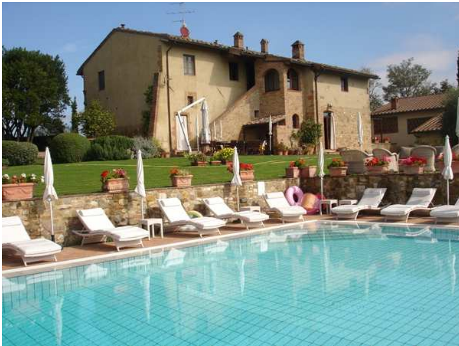
The 8 x 6 mt pool enjoying direct panoramic views of San Gimignano